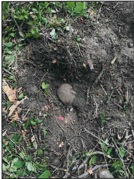
Closeup view of stone as found (NB5, Corner 1)