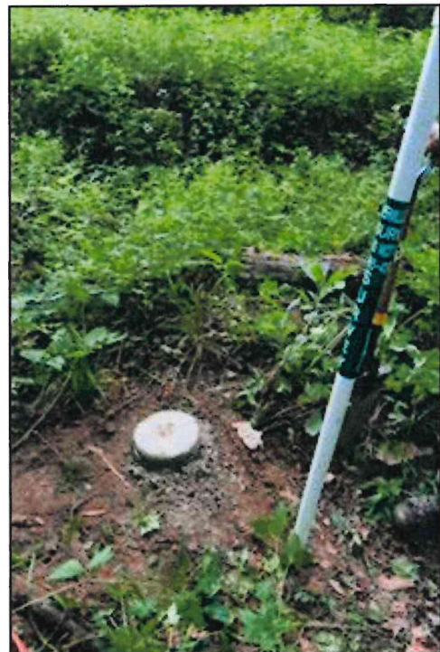
The VCS monument set in place of the post (NB6, Corner 2)

For details and documentation, refer to related sheet "Section Corner Record."