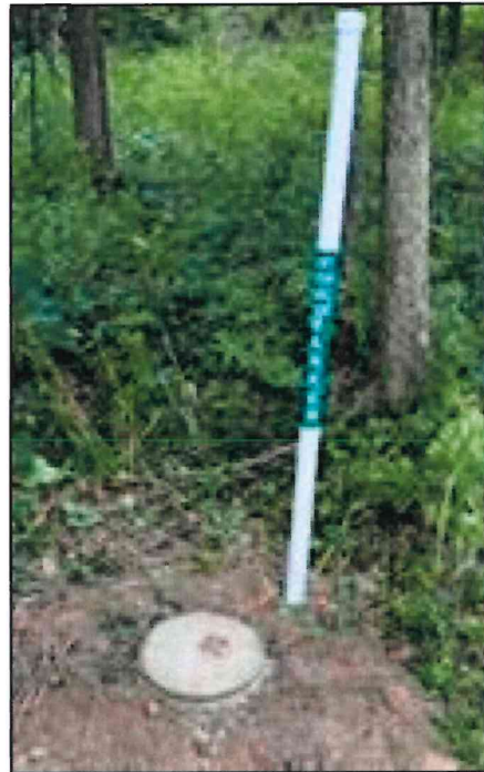
The VCS monument set in place of stone (NB5, Corner 1)