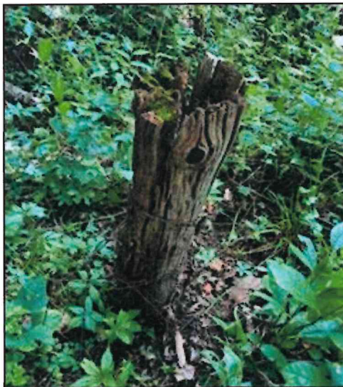
The wood corner post as found (NB6, Corner 2)