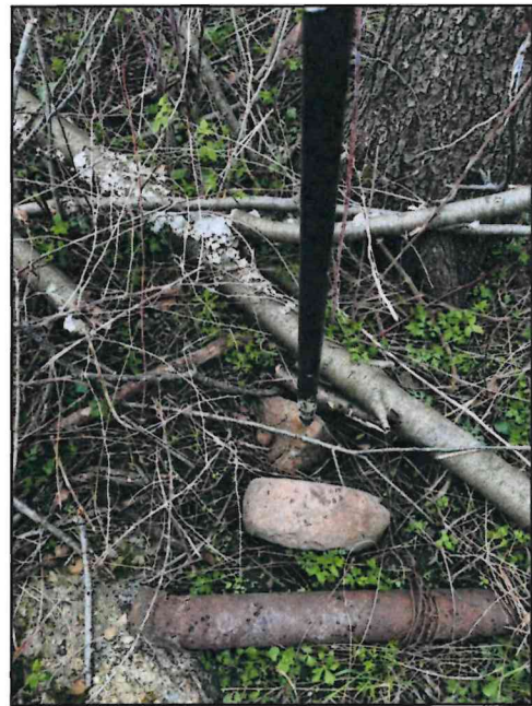
High point on stone as found and viewed from the South