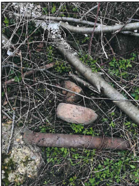
The stone as found and viewed from the South