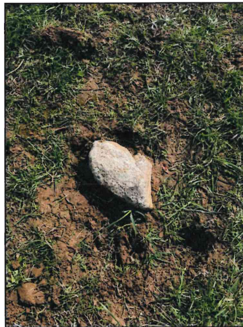
Close-up view of stone from above (ND5, Corner 2)

For details and documentation, refer to related sheet "Section Corner Record."