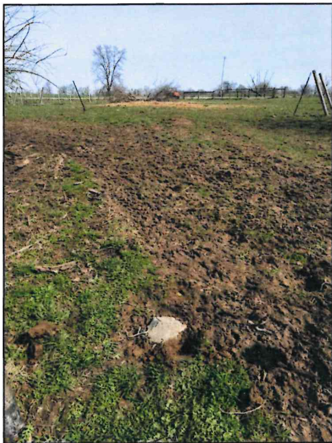
The stone as found and viewed from the South (ND4, Corner 1)