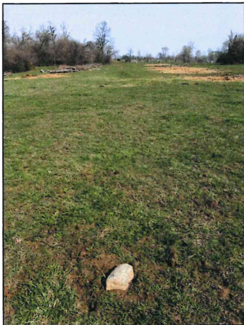
The stone as found and viewed from the South (ND5, Corner 2)