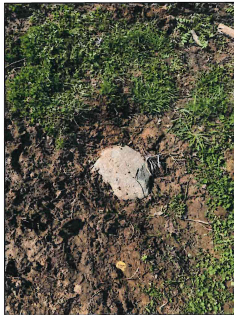
Close-up view of stone from above (ND4, Corner 1)