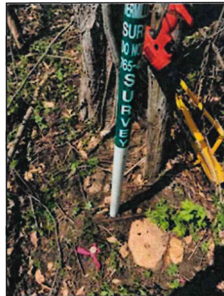
The stone and rebar as found and viewed from the Southeast (NE4-S.25, Corner 2)

For details and documentation, refer to related sheet "Section Corner Record."