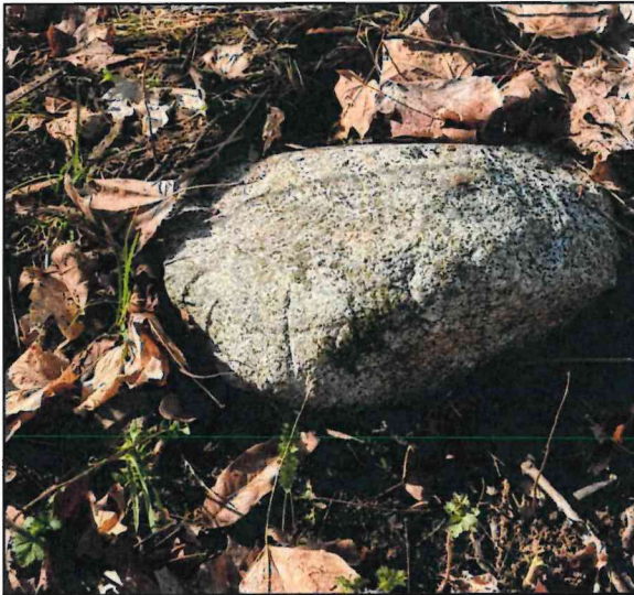
The stone as found and viewed from the North (NE5, Corner 1)