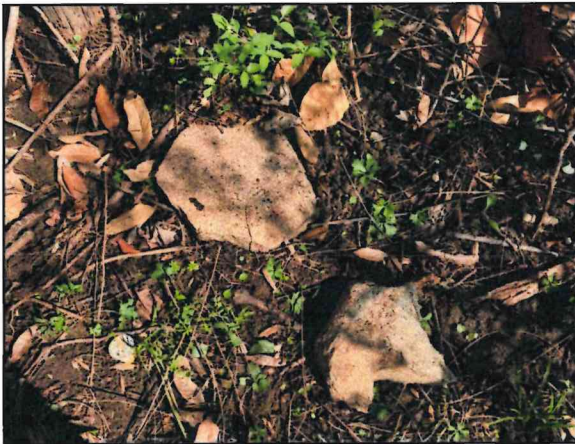
The stone and rebar as found and viewed from the Southeast (NE4-S.25, Corner 2)