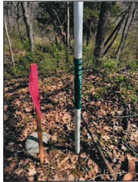
The stone as found and viewed from the West (NE5, Corner 1)